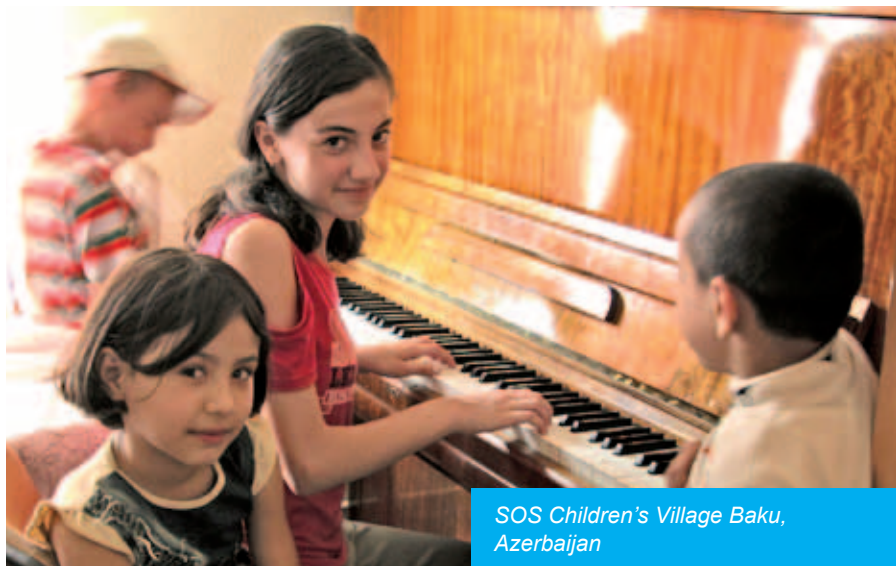
SOS Children's Village Baku, Azerbaijan

The floods in Pakistan in August 2010 elicited a similarly generous response. The £850 the school raised provided 65 packs of supplies which would last a family for ten days.