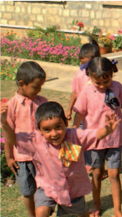
Children on their way to nursery in SOS Children's Village Surkhet, Nepal