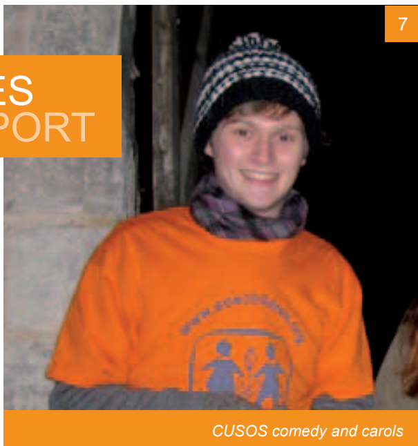
CUSOS comedy and carols

Cambridge University Supporters Group for SOS Children (CUSOS) celebrated the end of term with Away in a Manger , an evening of comedy and carols, which was held at a very special mystery location. After meeting in the city centre, guests were guided by a star to the Cellarers Chequer, a building which pre-dates Cambridge University itself. The space was beautifully decorated and opened especially for this event.