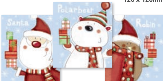
11 Snow Friends: 9 cards per pack, 3 of each design (£2.95) 86 x 97mm