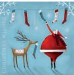
1 Christmas Stockings (£3.95) 126 x 126mm

Thank you for your support, and we hope you have a lovely time this Christmas.