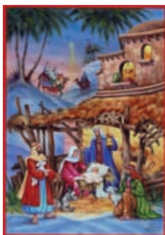
17 Advent Calendar (envelope included) (£3.75)