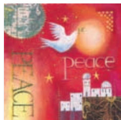
9 Peace on Earth (£3.95) 126 x 126mm