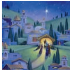
2 Bethlehem (£3.95) 126 x 126mm