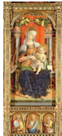
3 Madonna and Child (£3.95) 86 x 195mm