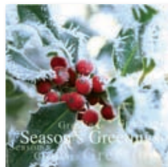
6 Berries (£3.95) 126 x 126mm