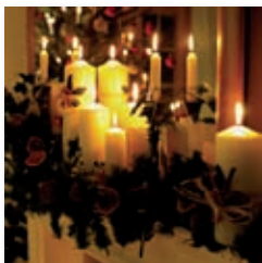
5 Candles (£3.95) 126 x 126mm