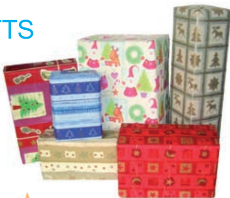
14 Gift wrap. 6 sheets and 6 tags (2 each of 3 designs) (£3.00)