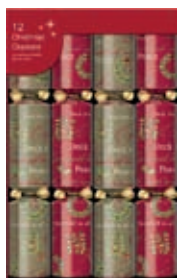
13 Crackers x 12 (£11.00)