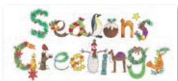
7 Season's Greetings (£3.95) 86 x 195mm