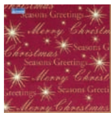
16 Napkins x 20 (£3.25)