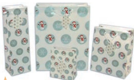
15 Snowman gift bags 4 bags with tags (£2.45)