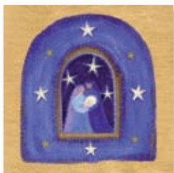
10 Holy Family (£3.95) 126 x 126mm