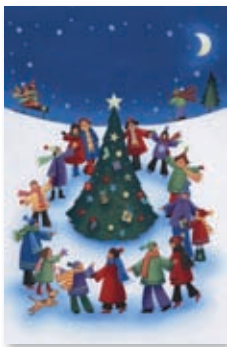
4 Round the Christmas Tree (£3.95) 100 x 152mm